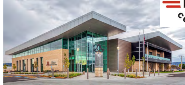
1. Uintah Conference Center